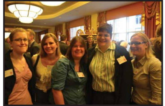
DD Resources' wellness committee at the St. Louis Business Journals' Healthiest Employer Awards.

The wellness committee is proud to be a St. Louis Business Journal's Healthiest Employer finalist.